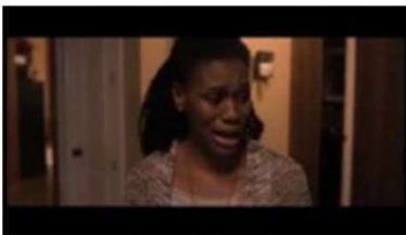
"War Room:" Casting out the Enemy